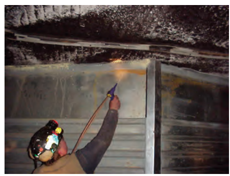
Seal metal stoppings.